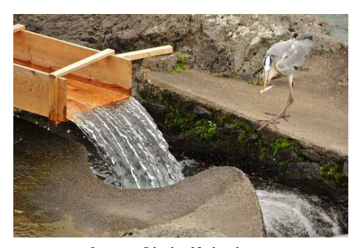
Sweetfish Kakeiryo (open water conduit fishing)

On the Kakogawa River where ship transport had developed from olden times due to the wide basin area and calm currents, Takasebune (barges) were the most efficient means of transport on river basins until the main mode of transport shifted to overland routes.