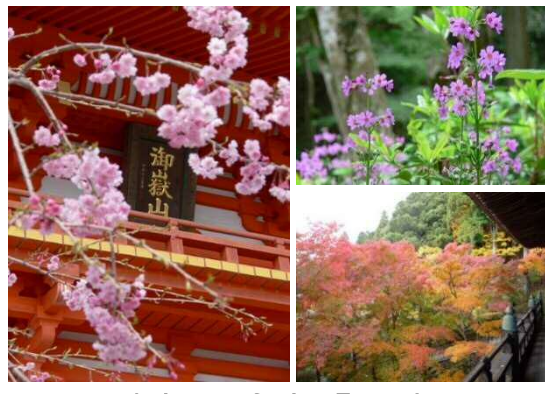
Colors of the Four Seasons (left: Cherry blossoms, top right: Japanese Primrose, bottom right: Autumn leaves)