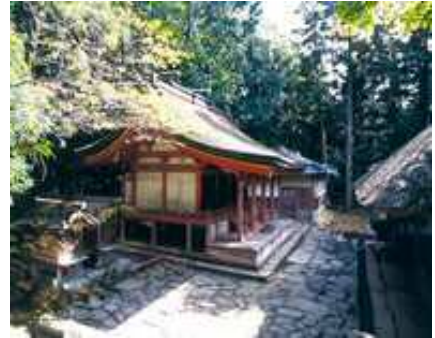
Kamikamogawa Sumiyoshi Shrine