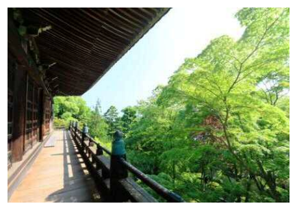
Daikodo (Great Lecture Hall)