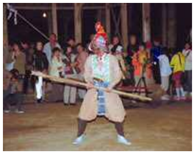
Shinjimai (Shinto ritual dance)