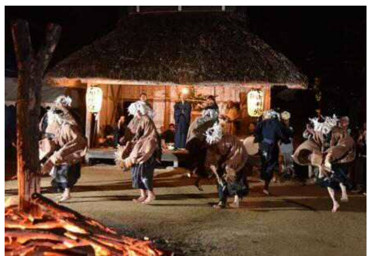
Dengaku Dance ( "Hometown Kitaharima That I Want To Preserve Photo Contest" prize-winning photo)

: For the first time in the country designated important intangible folk cultural property under Hyogo Prefecture as a ritual dance