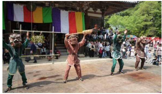
Onioi-Odori Dance (dance to drive demons out)