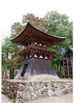
Choko-ji Bell Tower